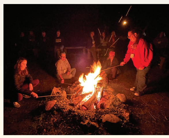
Ladies enjoying the campfire at last year's women's retreat.