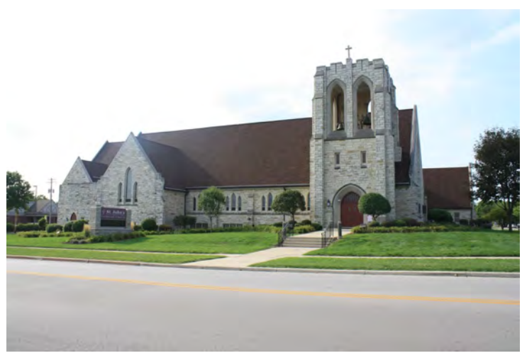
St. John's Lutheran Church 809 S. 6th Avenue, West Bend, WI 53095