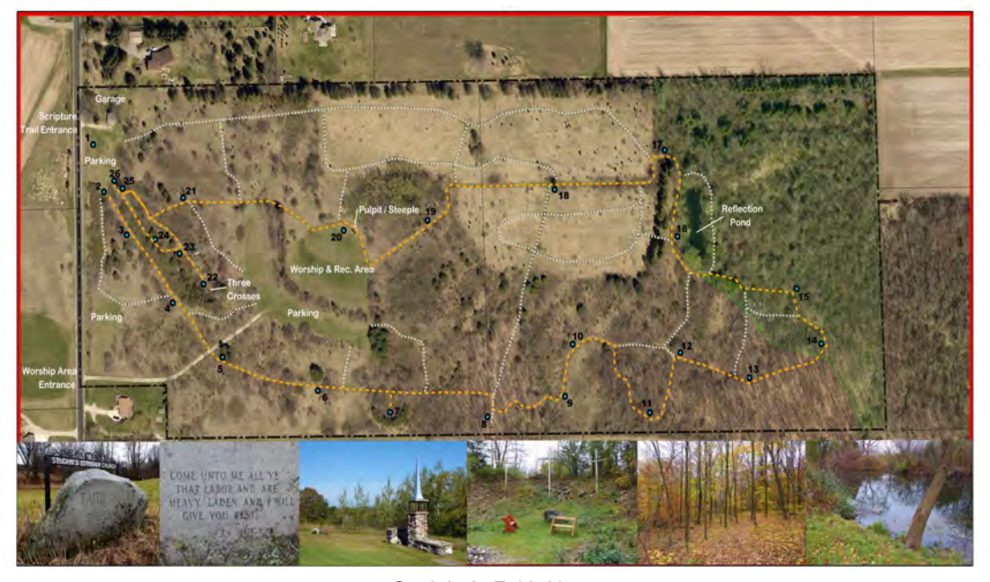
St. John's Faith Haven