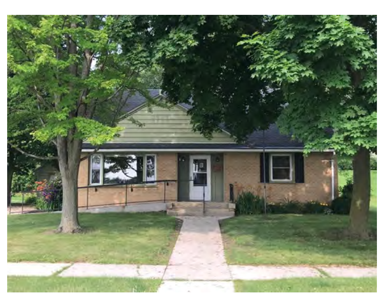
St. John's Main Church Offices: